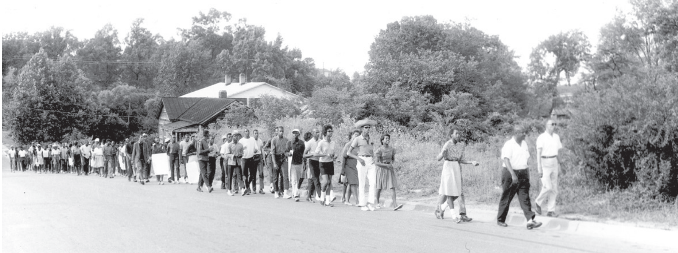
Civil rights protesters march from Bible Way Church to the Municipal Building.

The March on Washington draws 250,000 people. John Lewis, president of SNCC, closes his speech by warning that, if Congress does not pass “meaningful” civil rights legislation, SNCC will march “through the streets of Jackson, through the streets of Danville, through the streets of Cambridge, through the streets of Birmingham.”