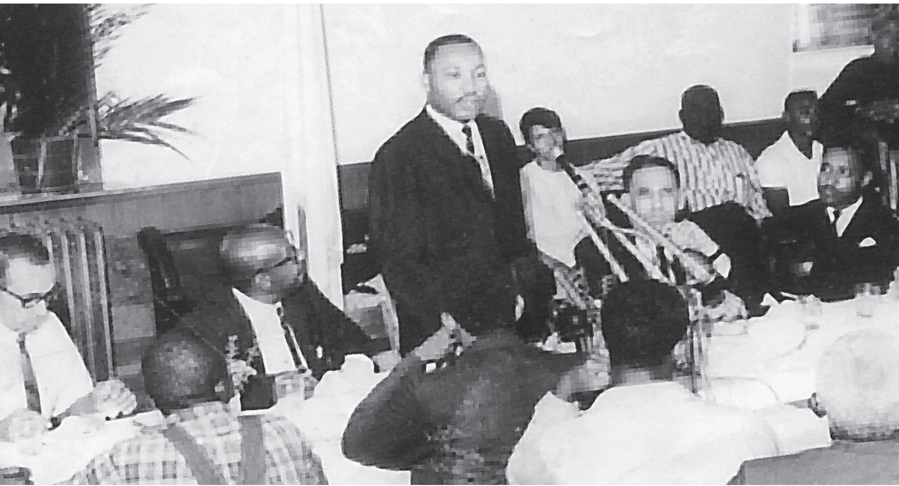
Dr. Martin Luther King speaks at High Street Baptist Church on July 11.

The grand jury indicts ten more civil rights leaders under the 1859 statute, including officials of the SCLC's Virginia state chapter and SNCC leaders.