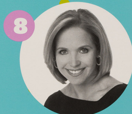
8 Katherine Couric 1957.

An outspoken activist for the preservation of open spaces and national battlefields.