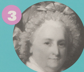
3 Martha Washington 1731.1802

Extensive landholder due to inheritance from her parents and three husbands; managed the estate profitably for her heirs.