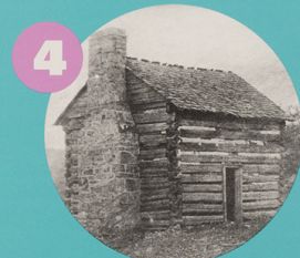
4 Mary Draper Ingles 1732.1815

Wife to the father of our country; established the social protocol for her successors.